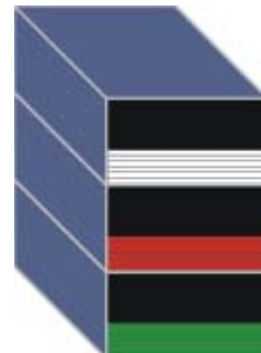
Proper Storage Method